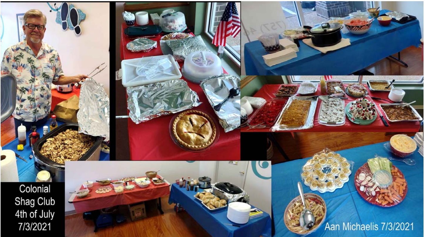
Colonial Shag Club 4th of July 7/3/2021